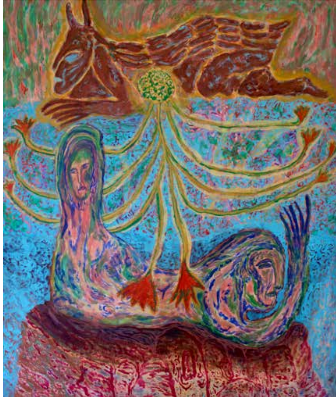
Featured image: Cecilia Fiona At the end of the world rabbit skin glue and pigments on canvas 120 x 100 cm more on p. 120-121