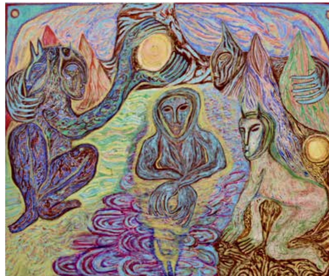
Image: The earth in its arm rabbit skin glue and pigments on canvas 120 x 100 cm